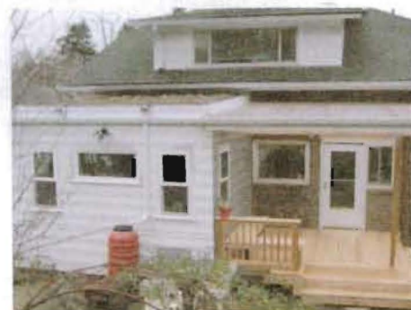
This Ballard addition includes a living roof, rainwater catchment system and the use of FSC lumber.

“I think many people don’t realize why they wake up in the morning with a stuffy nose or crusty eyes,” Kocharhook says. “There could be environ-